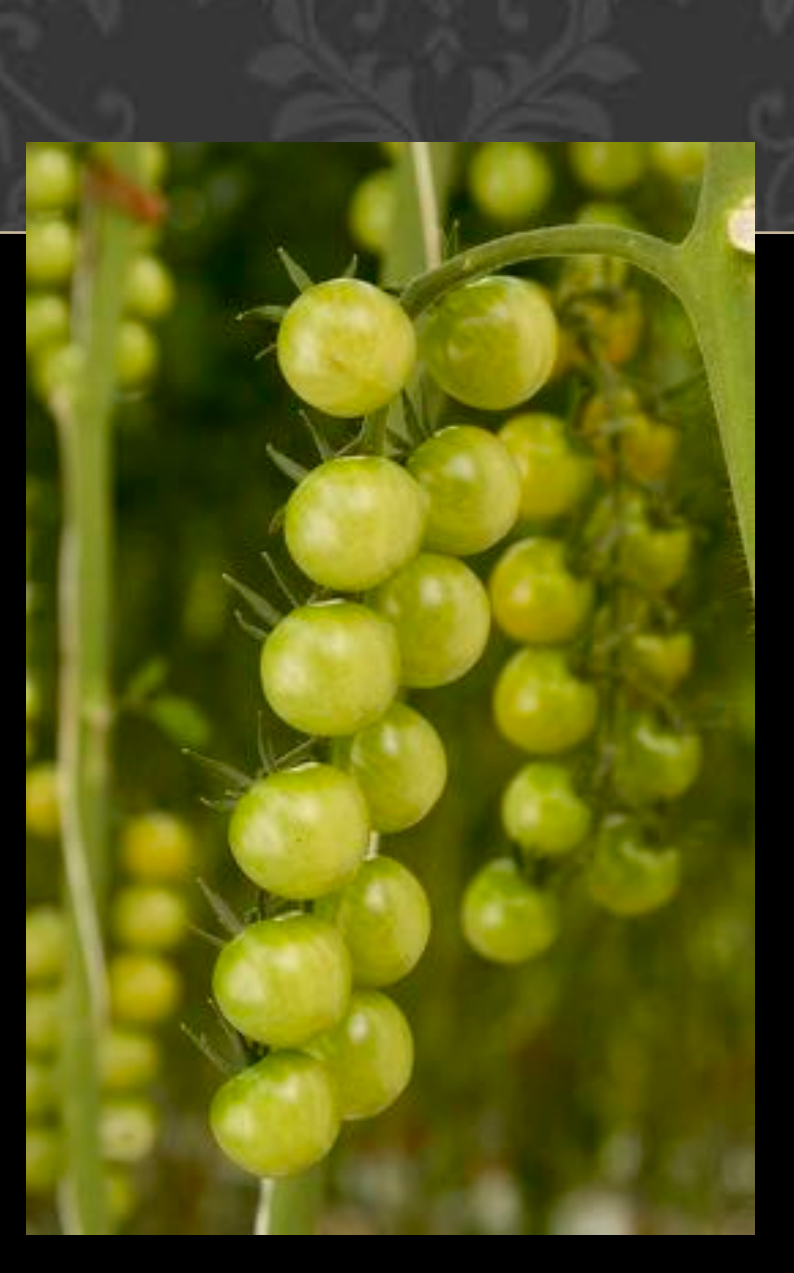
Greenhouse Grape Tomatoes San Jose y Su Agricultura